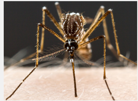
Virus carrier: Spread by mosquitoes, Zika is widespread in Central and South America, and is becoming more prevalent across the globe.

"In more subtle cases, the virus could theoretically impact long-term memory or risk of depression," says Gleeson, "but tools do not exist to test the long-term effects of Zika on adult